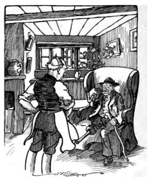
"WIPED HIS EYES TO THE MEMORY OF THE FAITHFUL, BLACK,"

He fumbled in his pocket, and producing the remains of a dirty handkerchief wiped his eyes to the memory of the faithful black.