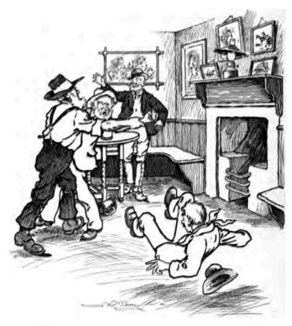
"THERE WAS UNPLEASANTNESS ALL ROUND THEN."

a wrong way of doing everything, and they'd chose the wrong.